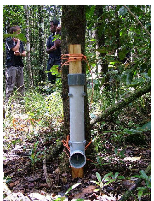
Figure 2. Front view of a 'hockey stick' dispenser designed for 20 g fixed bait blocks. Note the vertical wire at the entrance to prevent large Achatina snails from raiding the bait blocks. The dispenser is raised 10 cm above ground to deter snails and tenrecs and also to reduce humidity from the ground.