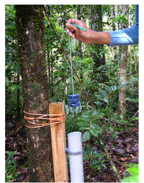
Figure 3. The 20 g wax blocks are threaded onto a length of thick wire. Checking the bait and refilling is straightforward.