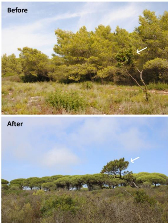
Figure 3. Comparative pictures of the managed area, before (October 2016) and after (October 2022) Pinus halepensis removal. Before treatment, P. halepensis stands completely obscured the stone pines behind. Note the position of the same strawberry tree Arbutus unedo in both pictures (white arrow).

Landscape change: The removal of P. halepensis led to a drastic change in the landscape, from a closed forest up to 7-10 m high to a sun-exposed, medium-sized shrubland (height ca. 1.5-2 m) (Figure 3).