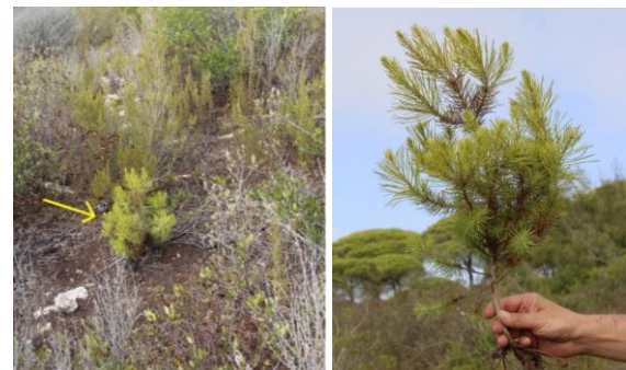
Figure 4. Seedlings of Pinus halepensis that appeared in treated plots.

Seedling reinvasion: Six years after treatment, reinvasion in treated plots was negligible. We found 36 seedlings in 5,000 quadrats (mean \pm SD = 0.007 \pm 0.098 seedling/m 2 ) (Figure 4). Seedlings were highly aggregated east of the treated area (Figure 1). Felled trees showed no resprouting or regeneration.