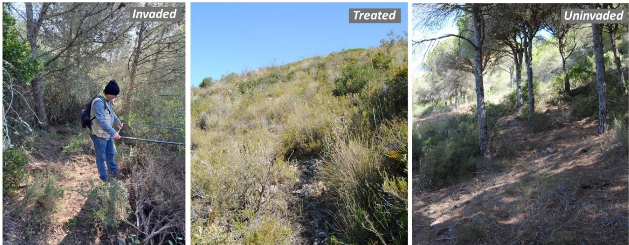
Figure 2. Pictures of the three plot types analysed: Invaded with Pinus halepensis , treated (three years after pine removal) and uninvaded.

treated plot (ca. 2,000 m 2 ) used for assessing perennial plant recovery, seedling density analysis was extended throughout the entire treated area (22.4 ha) by a systematic search. Quadrats (1 x 1 m) were placed along twenty 250 m-long linear transects (i.e., 250 quadrats per transect), that were distributed across the treated area (total sampling effort = 5,000