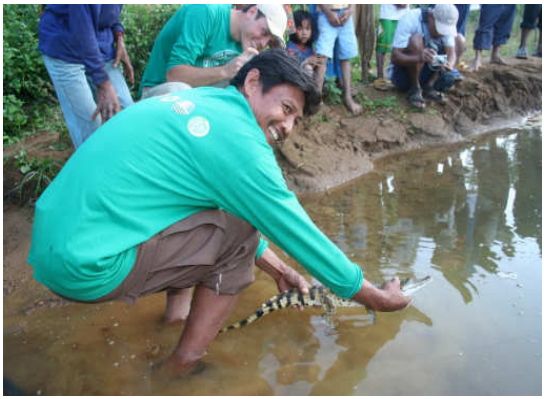
Figure 2. Releasing a head-started Philippine crocodile in the newly created Diwagden Lake, 2007 (photo: M. van Weerd).

In an attempt to give some indication of survival rates of wild (non-head-started) hatchlings, 36 hatchlings from five nests situated in various habitats (adjacent to creeks, ponds and fast-flowing rivers) were monitored during one year after hatching between 2000 and 2006 through quarterly surveys (van Weerd et al. 2006).