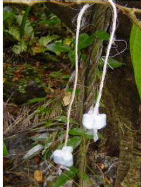
Figure 2. A bolo bait.

Effect of bait on non-target species: During the course of the project, three methods were used to assess any associated effect of the rat bait on non-target species, including bats, birds and land crabs. Pre- and post-application index of abundance surveys were performed, in combination with observations and carcass searches to assess if there were direct effects of the rodenticide bait on native wildlife.