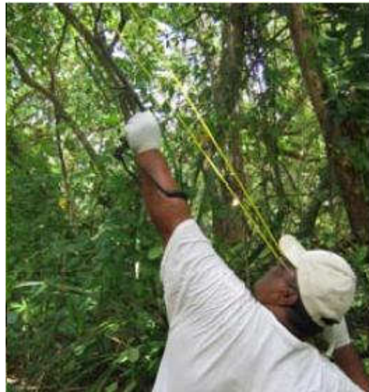
Figure 3. Bolo bait being catapulted into the forest canopy.

Monitoring: To monitor eradication efficacy, three methods were used: live-trapping, wax chew blocks, and radio-telemetry. Live trap transects paired with wax chew blocks were randomly established and opened prior to and post bait application to monitor trap success and the condition of any captured rats. Post bait application efficacy monitoring began 12 days after bait was spread on the island; traps and