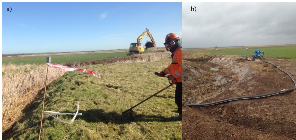
Figure 1: Displacement Area, a) prior to surface scrape and water drawn down, and b) subject to surface scrape and removal of water.

Recapture of water voles: Water voles were live captured using the same pre-displacement method, at all five sites between 18 and 26 April 2017 to investigate the fate of marked individuals and retrieve collars. Additional traps were used to recapture collared individuals whose locations were outside of the study sites.