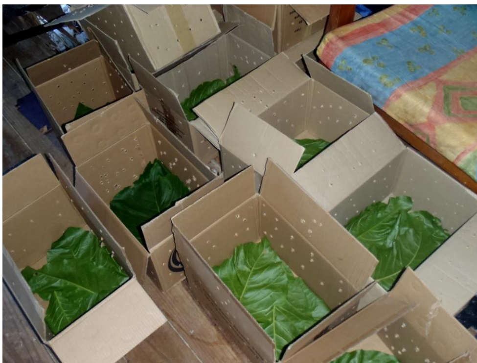
Figure 1. Individual Seychelles warbler translocation boxes. Note small air hole punctures and pisonia leaf lining.

We attempted to catch individuals from across the entire island with only two restrictions: 1) avoid possible breeding territories, and 2) avoid taking both dominant and subadults/subordinates/recent fledglings from the same territory where they may be first order relatives. Subordinate individuals were particularly targeted as they were surplus,