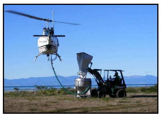
Figure 2. Helicopter with bait spreading bucket being filled by loader.

The bait was applied aerially from a helicopter using a specially designed under slung baitspreading bucket (Fig. 2). Prior to the operation the bucket was calibrated to spread bait at a rate of 4 kg/ha. These calibration trials used non toxic bait produced to the same specifications as the poison bait. Prior to bait application the boundaries of each island were flown and mapped using Differential Global Positioning System (DGPS) to ensure the entire area of each island was covered. The onboard GPS (AG-NAV® 2 GPS) was downloaded at the same time to ensure compatibility with mapping programmes.