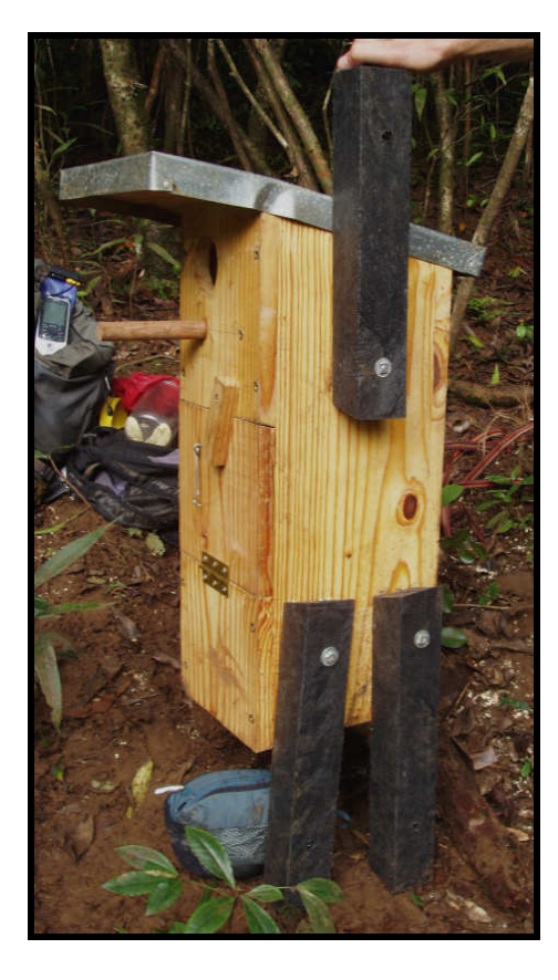
Figure 2. Improved nest box for echo parakeets with metal covered roof.